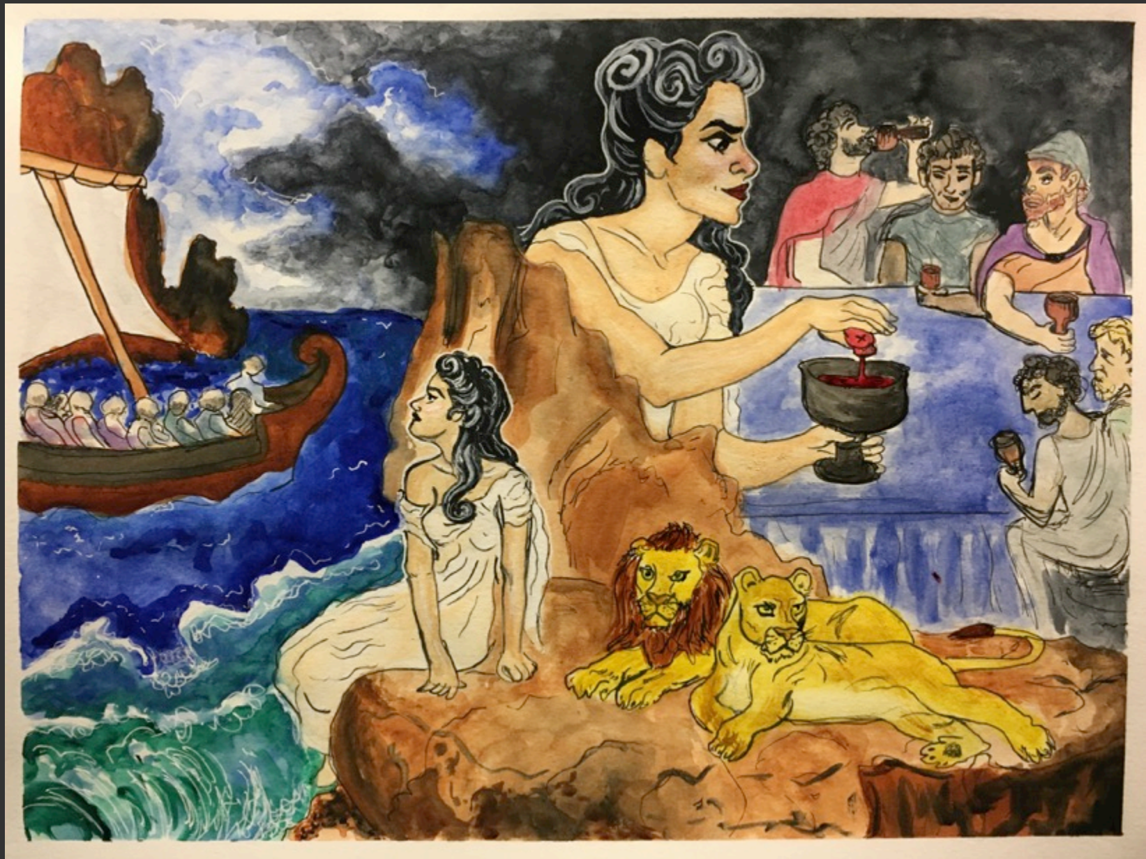
Sophia Nicholson "Circe" Watercolor (2018) 11x14"