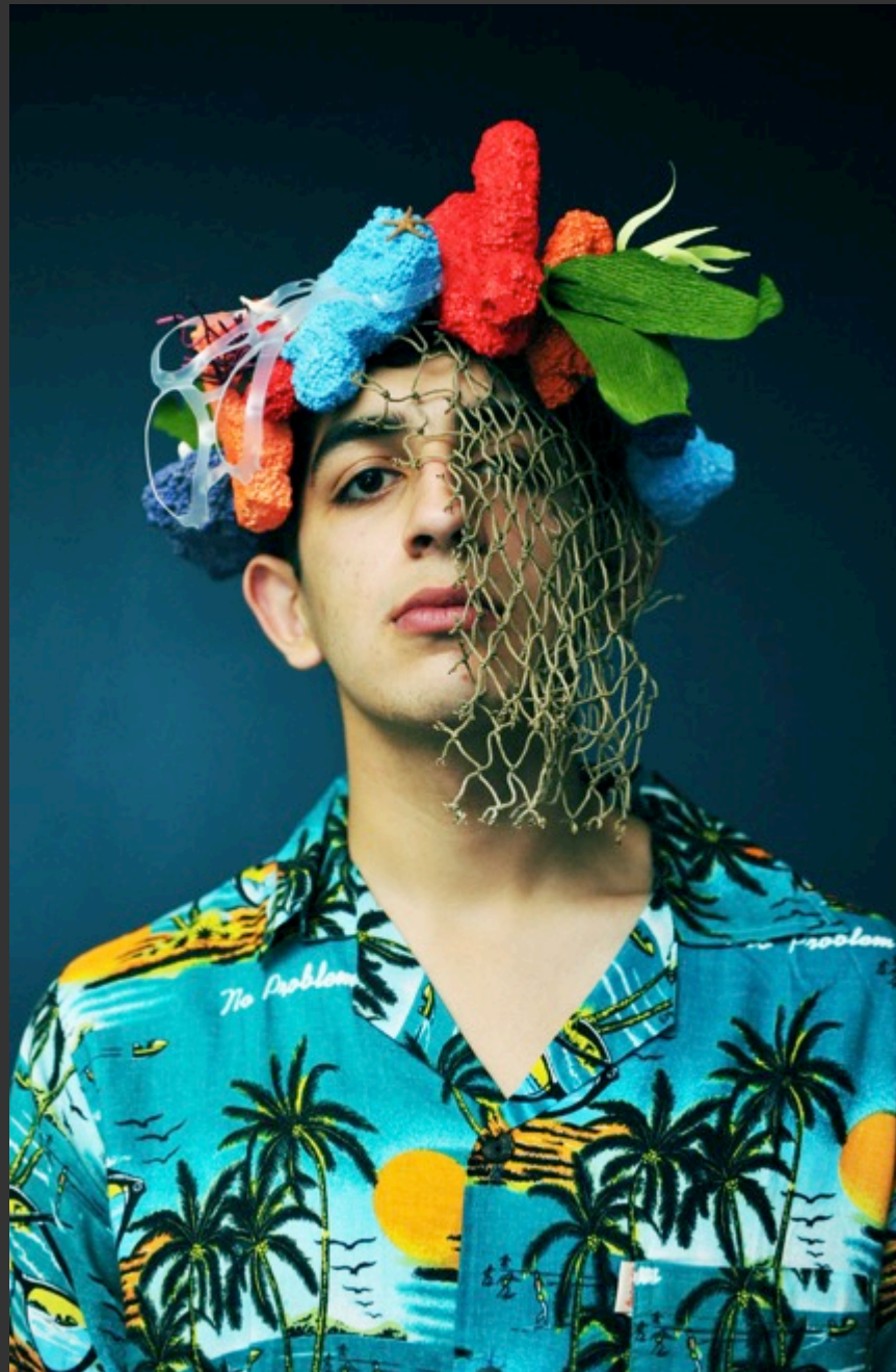
Noah Laroia-Ngyuen "Poseidon" Digital Photography And Mixed Media (2017) 16x20"