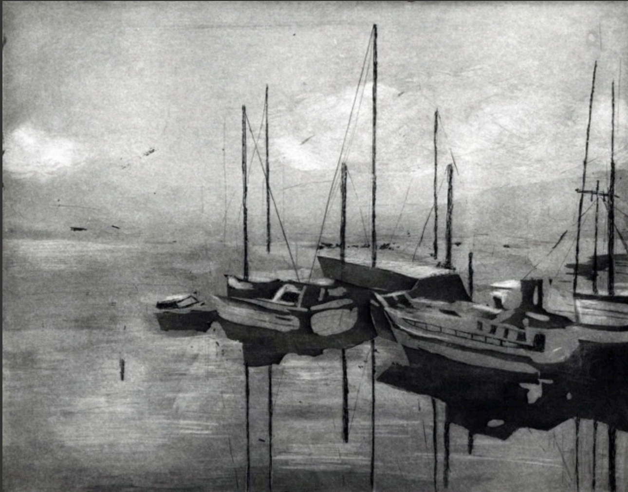
Joohye Park "Foggy Port" Etching and Aquatint (2011) 8x10"