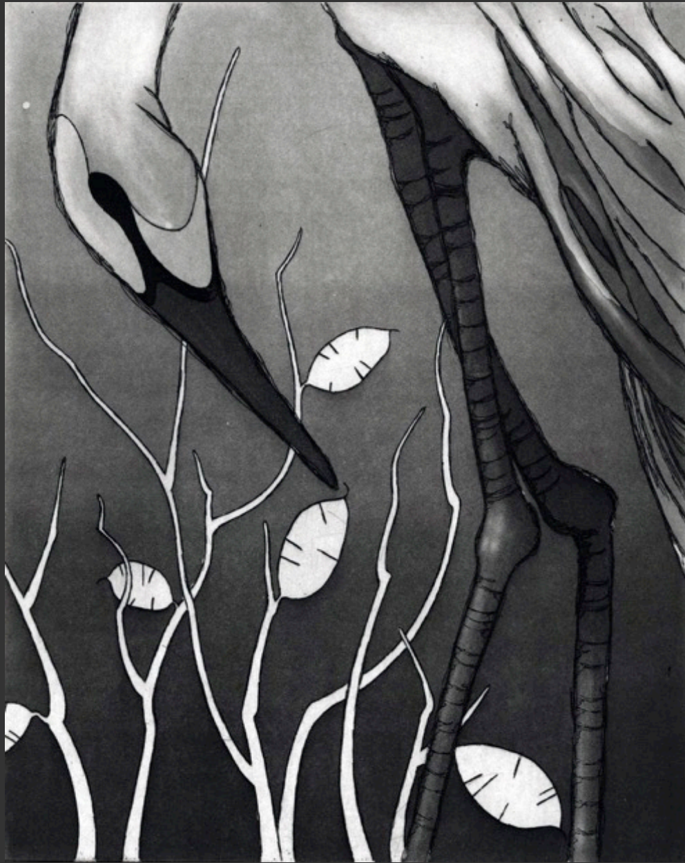
Emily Eversgerd "Tiptoe in the Moonlight" Etching and Aquatint (2011) 8x10"