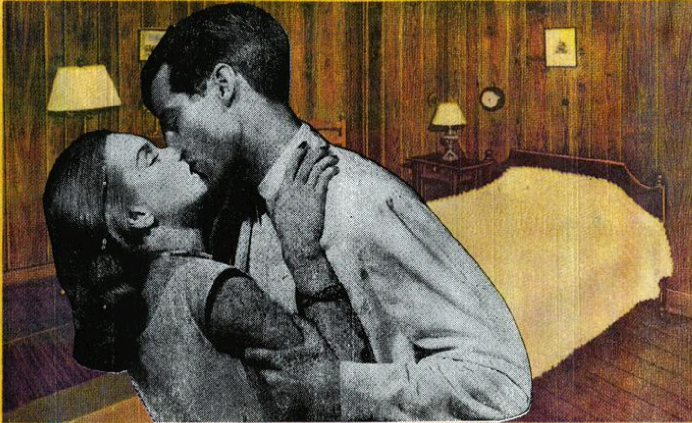
President Franklin D. Roosevelt's Bedroom, Little White House, Warm Springs, Georgia