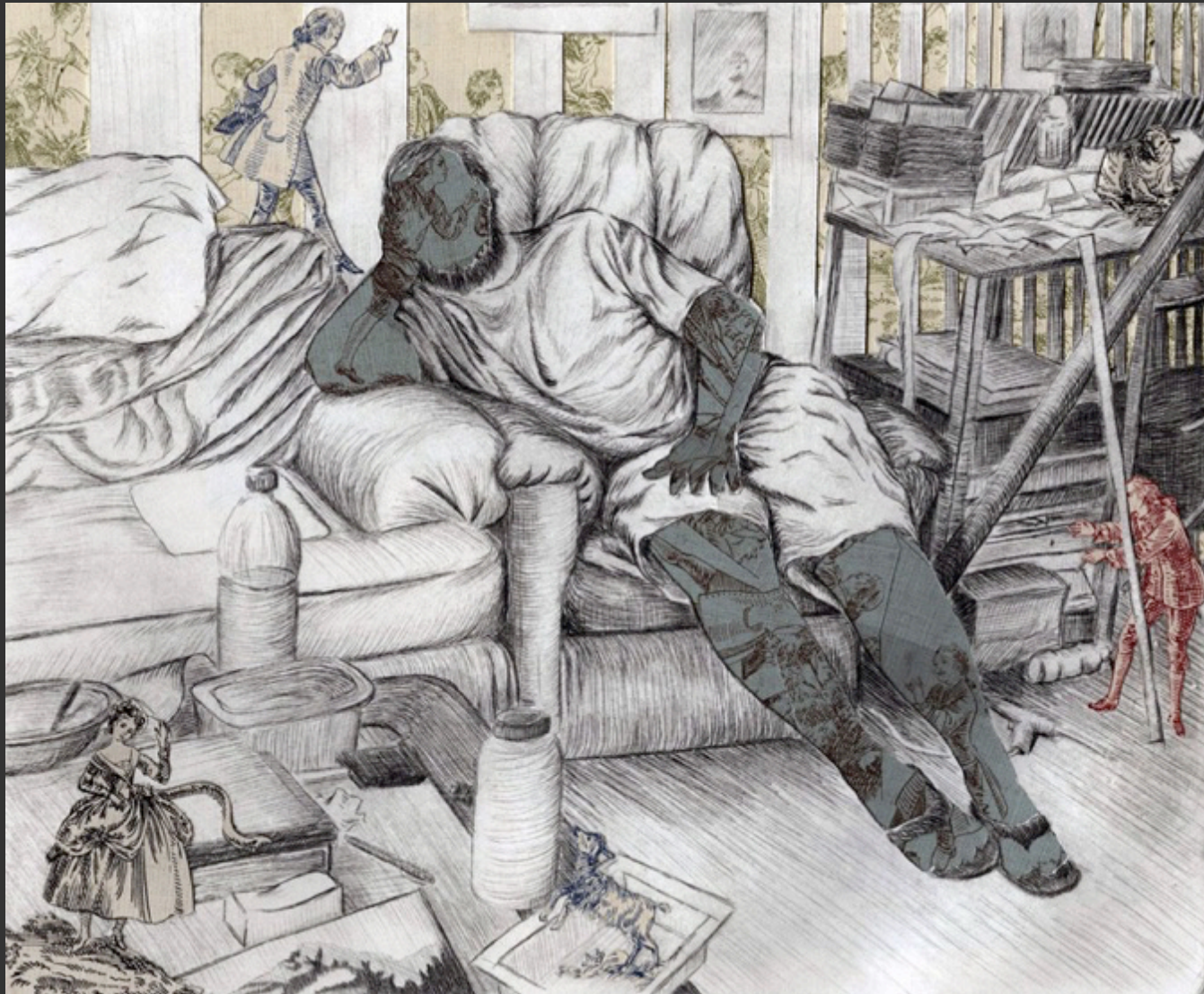
Spenser Brenner "Couch Man" Collage and Drypoint (2013) 8x11"