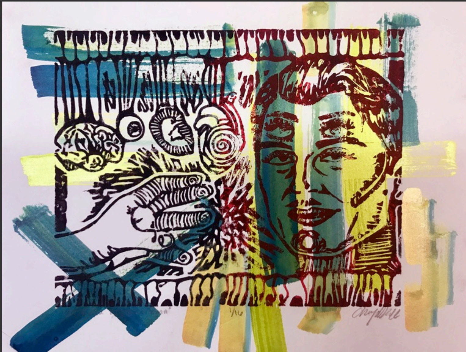
Chey Miller "Until the Heavens Burn" Relief Monoprint (2018) 9x12" "Reach"