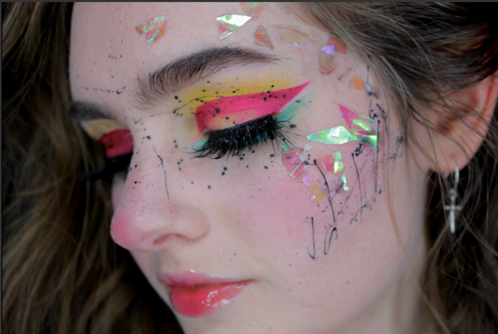
Ava St. Pere "What Divides You?" Make up, stencil, silkscreen (2018) 9x12""