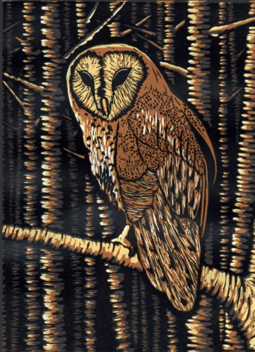
Emily Eversgerd "Night Watch" Relief/Linoleum (2011) 9x12"