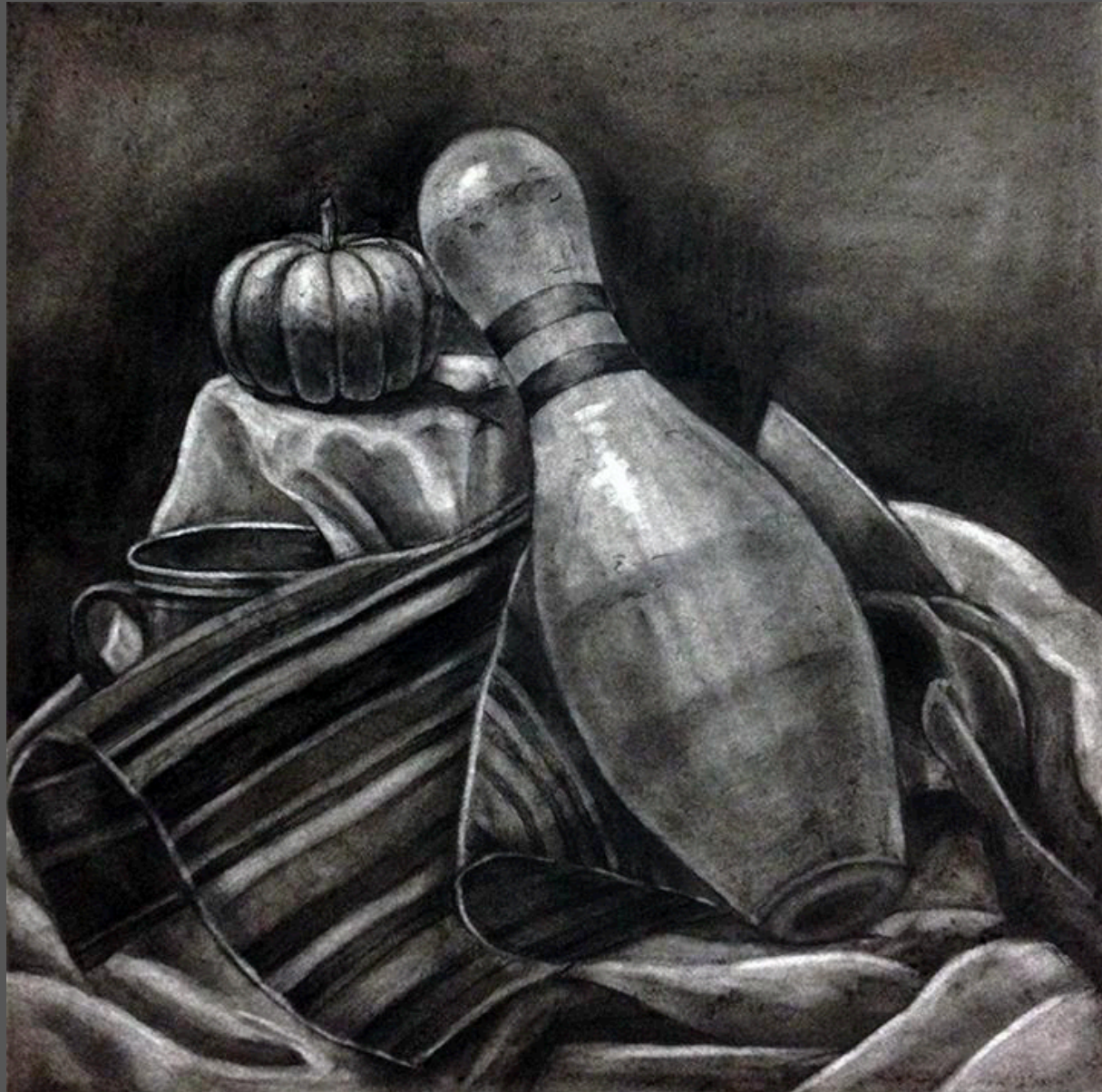
Gwiyeon Han "Charcoal Still Life" Charcoal (2014) 18x24"