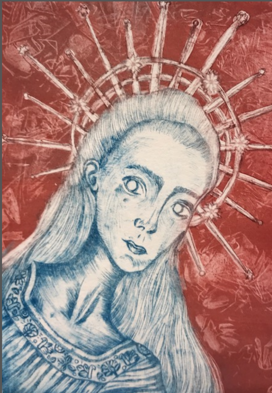
Monica Morales "Mea Cupla" Intaglio, Monoprint, and drypoint (2017) 5x7"