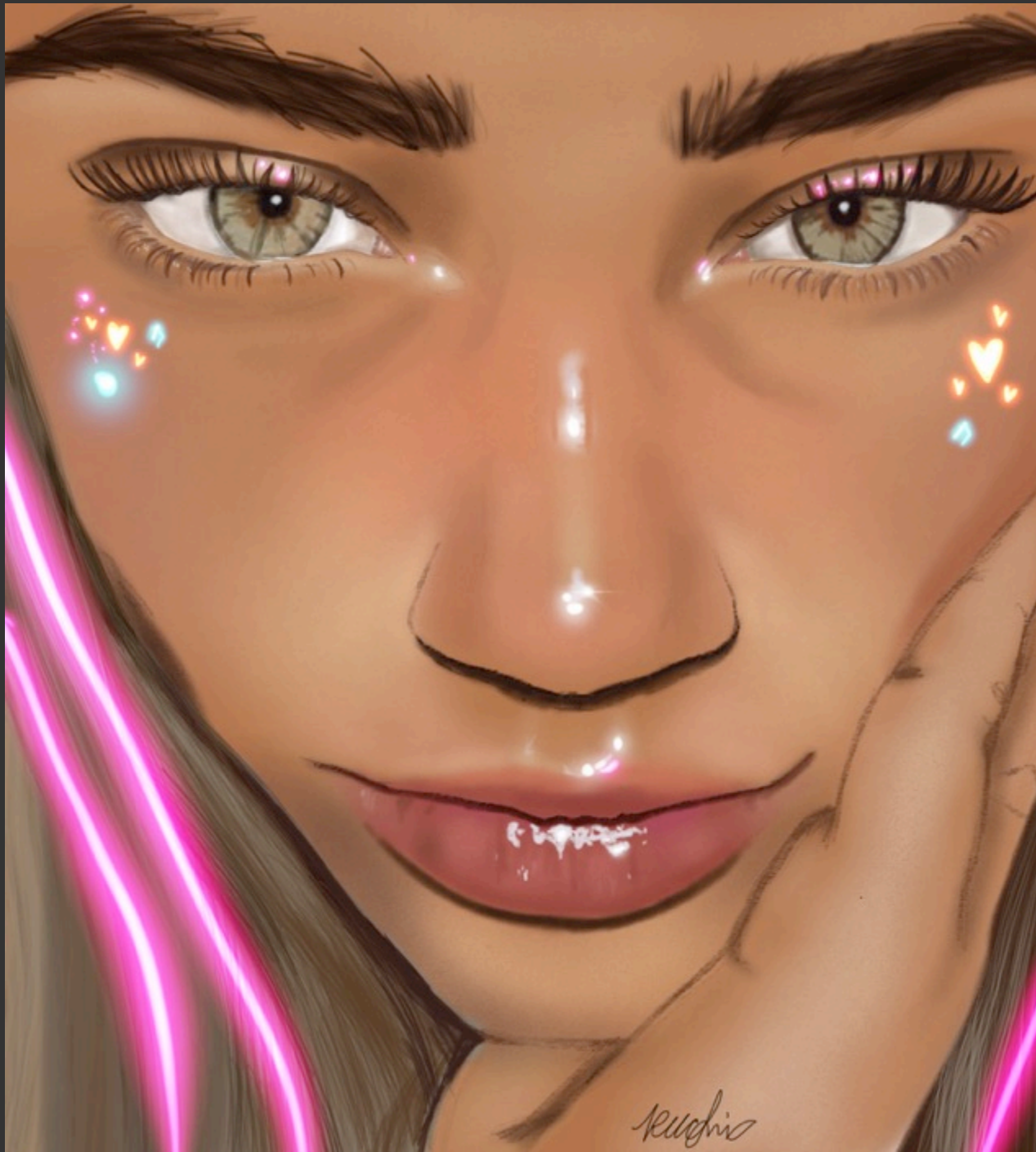
Reece Smith "Untitled" Digital Illustration (2019) 14x12"